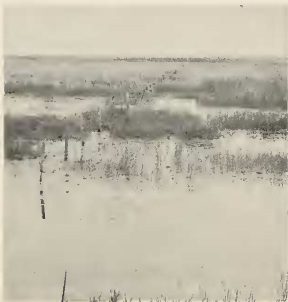
FIG. 1. Coastal Marsh habitat in Cameron Parish, Louisiana. "Paille Fine" dominant vegetation.

Before rice planting begins in March and April, many Fulvous Tree Ducks concentrate in the fresh-water marshes of Vermilion and Cameron parishes. On the Lacassine Refuge, in Cameron Parish, the preferred marsh type is a fairly uniform stand of "Paille Fine" or maidencane ( Panicum hemitomon ) containing many small ponds (Fig. 1). Watershield ( Brasenia Schreberi ) is abundant in most of these ponds (Fig. 2).